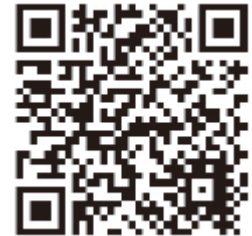
Information on medical institutions and mass inoculation venues.