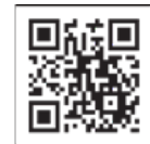
Corona Vaccine Navi

* Inevitable circumstances ... Single employees, pregnant women returning home, etc.